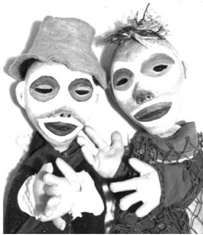
Circus clowns - hand puppets by Betsy Tobin