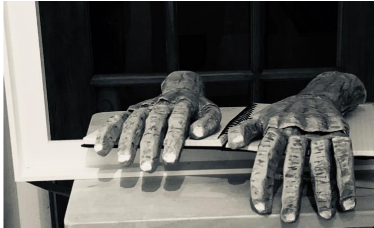
Hands portray aging in a scene about literacy