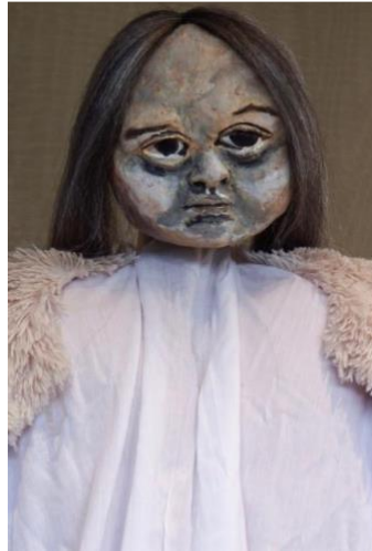
Character will start small, then rise to loom over audience Puppet by Michael Gunst

The show was scheduled to open in the Canyon Theatre in May 2020, but was delayed due to the pandemic and the subsequent absence of theatre programming at the library. The show benefits from the extra time we have put into it. We have deliberated over every decision. We are thrilled to finally prepare for our opening shows in November 2023.