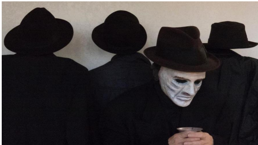
Hats and jackets manipulated in the background behind masked actor Mask by Betsy Tobin