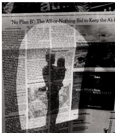
Images come to life with light & shadow in Newspaper Scene