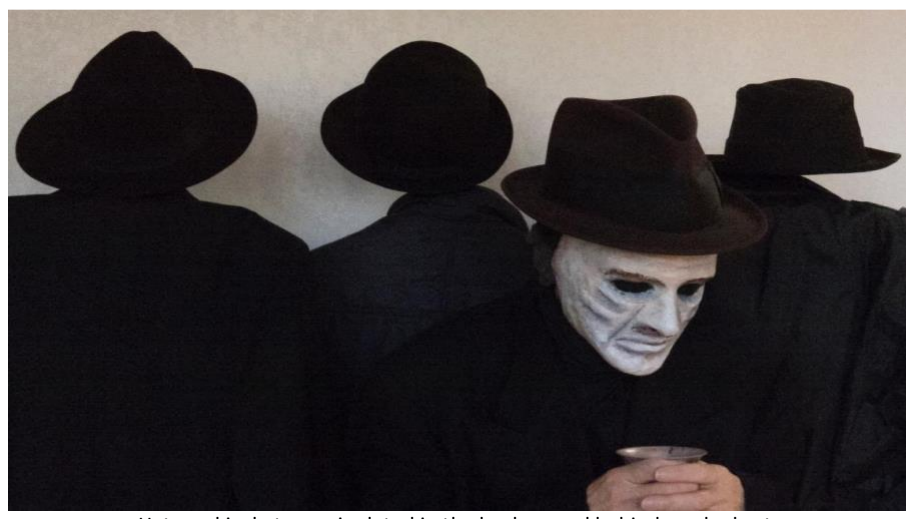
Hats and jackets manipulated in the background behind masked actor Mask by Betsy Tobin