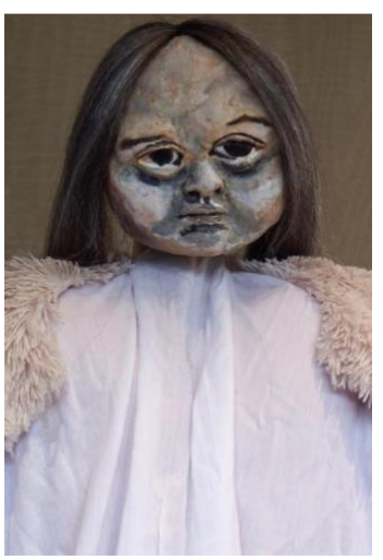
Character will start small, then rise to loom over audience Puppet by Michael Gunst

The show was scheduled to open in the Canyon Theatre in May 2020, but was delayed due to the pandemic and the subsequent absence of theatre programming at the library. The show benefits from the extra time we have put into it. We have deliberated over every decision. We are thrilled to finally prepare for our opening shows in November 2023.