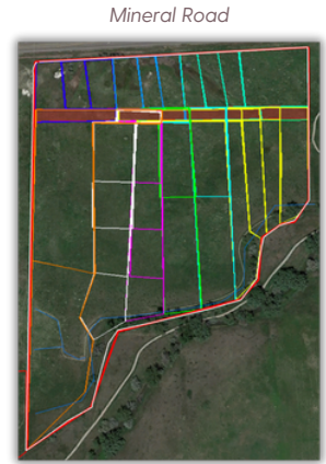
A property specific grazing plan created in November 2022, for grazing OSMP property, Canino. This property is part of the SLC

Lastly, on Minnetrista II and Canino properties, which we've been working on through the Shared Learning Collaborative, we've seen a consistent increase in live plants. This property is difficult to manage with the prairie dogs, collaborative effort, irrigation system, and general level of bare ground. This increase demonstrates that we are improving the fields' ability to photosynthesize, thus sequestering more carbon in the soil. Photos demonstrating this ecosystem evolution are available in the monitoring section of this proposal.