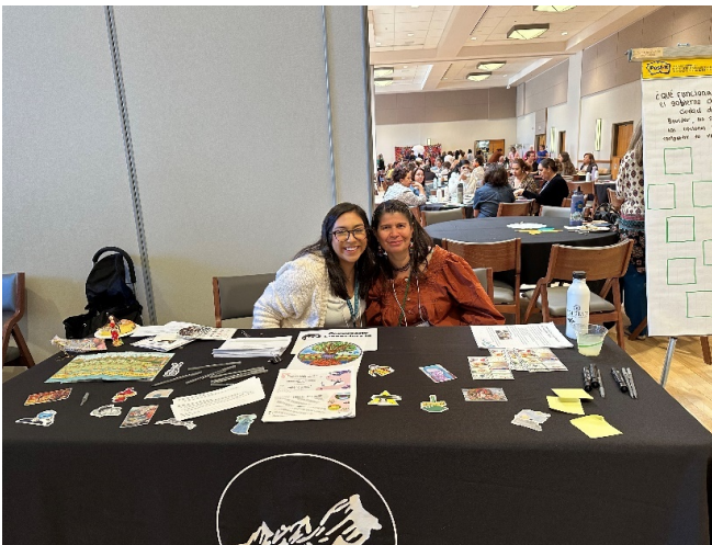
CC-in-Rs tabling and sharing resources at Cumbre Compañeras – July 2023