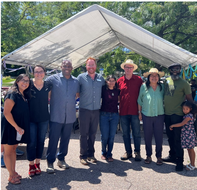
CC-in-Rs with council members and staff – July 2023

CC-in-Rs created a vision for a community celebration, which they designed and coordinated for participants of 'Building Power & Raising Voices' sessions as well as for their communities. The focus was on celebrating cultures within Boulder, educating community members about how to engage with city government, building relationships, and sharing wellness activities and resources. CC-in-Rs were grateful to receive funding from the Community Foundation Boulder County to support this civic engagement work.