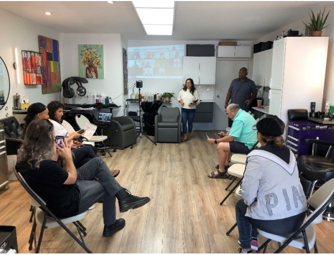
'Building Power & Raising Voices' session – July 2023

Themes from this session include community strengths: community and people of Boulder, some city services, and alternative transportation infrastructure. Several challenges were also identified: bullying in schools, racial disparities, traffic, and people no longer able to afford living in Boulder. Please see the appendix for full notes from this session.