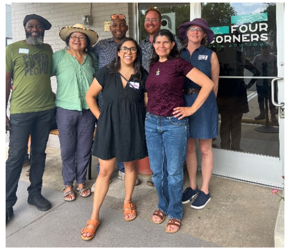
CC-in-Rs and staff – July 2023

We welcome City Council's feedback on this update and encourage you to share any thoughts through this feedback form . Previous CC-in-R updates, including the most recent update in May 2023, may be found on the CC-in-R webpage .