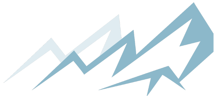
CC-in-Rs present to City Council – Sept 2023

CC-in-Rs presented these priorities and community input to Department Directors on May 8 and to City Council on Sept. 14.