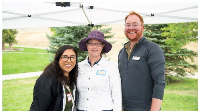
CC-in-Rs tabling and sharing resources at What’s Up Boulder – Sept 2023