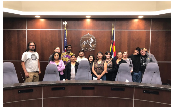
Budget Update & Public Hearing Training – Sept 2023

As the 2024 city budget cycle progressed, staff learned of department directors who did not consider submitting specific proposals because they did not align with top community priorities, as shared by CC-in-Rs. In addition, staff heard from members of the Executive Budget Team who articulated that when the team was at an impasse in funding specific items, they looked to the CC-in-R community priorities to guide their decision-making.