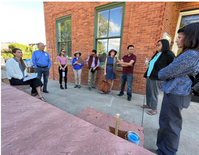
CC-in-Rs tour the city's Civic Area – Sept 2023

In September 2023, CC-in-Rs joined staff and representatives from applicant organization Historic Boulder to tour the city's Civic Area and learn more about a proposed Historic District, including Central Park and five city-owned buildings that are already designated as historic landmarks: the Penfield Tate II Municipal Building, the Glen Huntington Bandshell, the