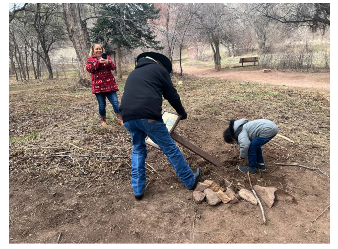
Tribal Representatives and Comanche and Lakota children helped remove signs at The Peoples' Crossing. In February, city staff received guidance from Tribal Representatives to remove them.