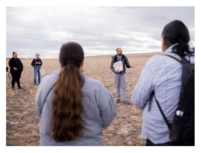
During the Consultation, Tribal Representatives, City Council Members, city staff and city consultants visited the Jewell Mountain Open Space area – an area with known Indigenous cultural resources.