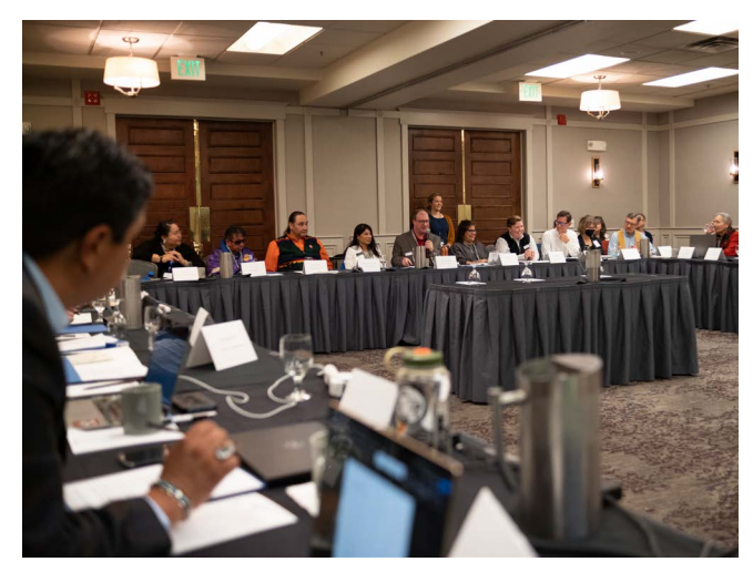
City staff appreciated the insightful guidance Tribal Representatives provided and the time spent discussing and revising the proposed MOU during the 2023 Consultation.

City of Boulder staff extend our gratitude to Tribal Representatives from federally recognized American Indian Tribal Nations for participating in the in-person Consultation in Boulder on Wednesday, March 15 , and Thursday, March 16, 2023 . The 2023 Consultation primarily focused on the proposed MOU and site visits to city-managed open space areas. The words and guidance Tribal Representatives have provided during the March Consultation – and past Consultations and Working Group meetings with Tribal Representatives – have left a deep impression on city staff, and City Council and Board members, and we look forward to continuing opportunities to listen and learn from your Nations in the future.