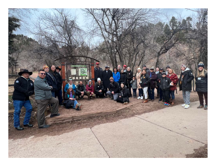
Consultation participants visited The Peoples' Crossing – an area Tribal Representatives renamed in 2021 – as part of ongoing city-Tribal Nation education and interpretation collaboration.