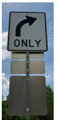
Examples of turn restrictions at Broadway and Hawthorn Avenue.