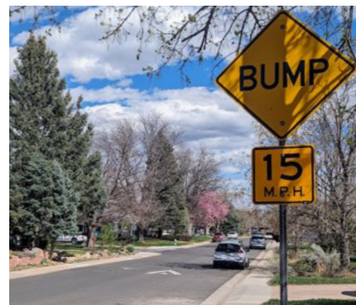
Example of speed bump on Floral Drive.