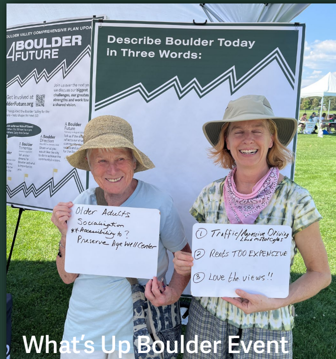
What's Up Boulder Event