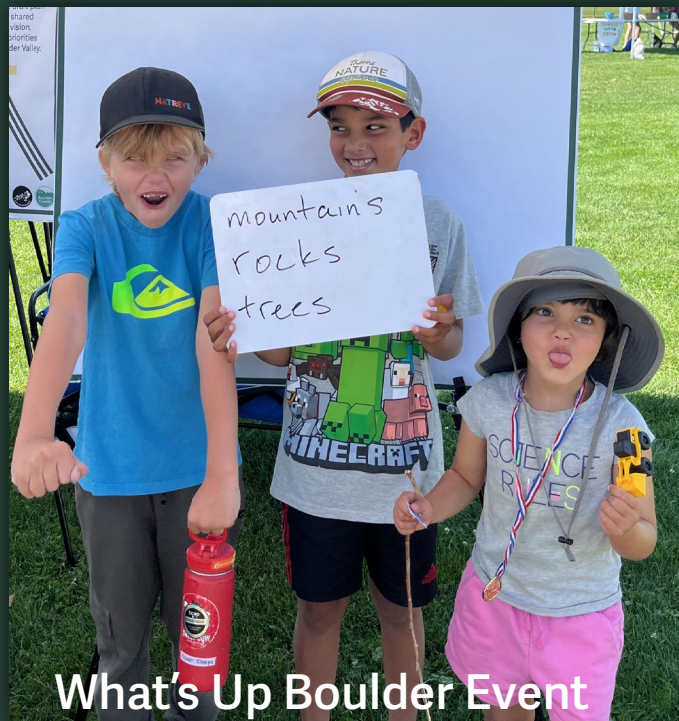
What's Up Boulder Event