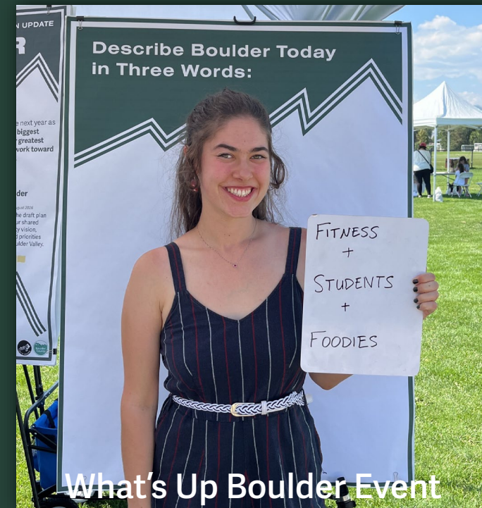
What's Up Boulder Event