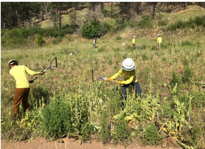
Weed whipping mullein at Settler's Park