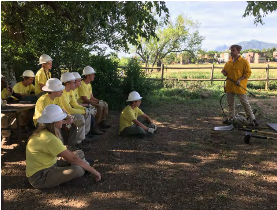
Crew 2 getting an environmental education lesson on forest fire ecology by a former Junior Ranger.