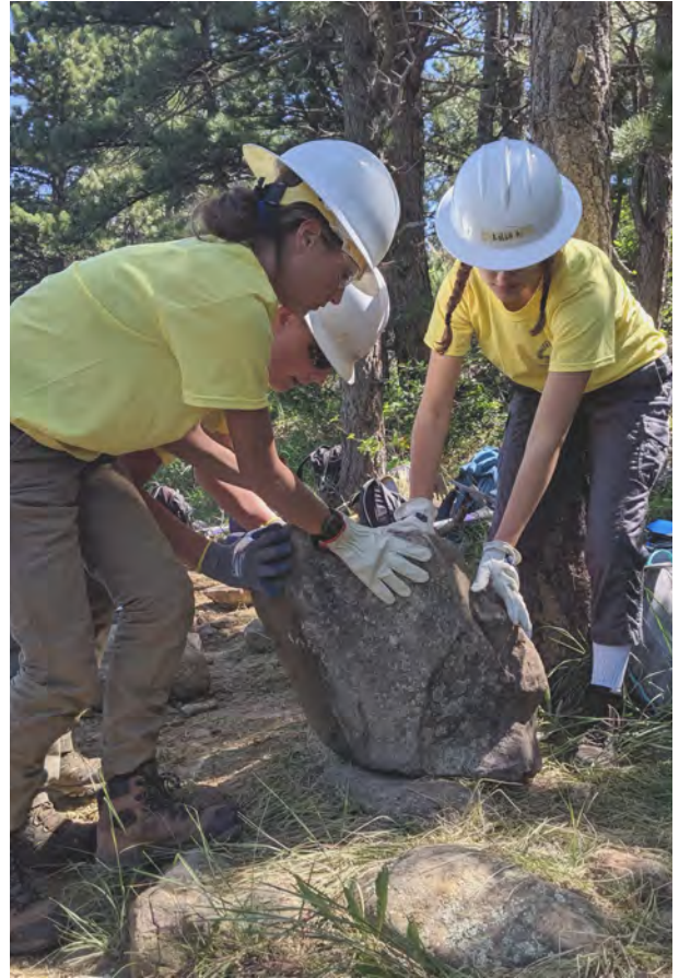
Rock work requires patience, teamwork, and good communication.

"A big challenge that our crew faced as a whole that made us come together and be more of a team was on the Tuesday of the second week when we were coming down Flagstaff Road. We got stuck up on Flagstaff for about 1.5 hours. During that time our crew played Mafia... lots of Mafia. We ended up hiking down View Point trail due to the time. This has changed not only me but probably the other crew members because it taught us that even though something we have to do isn't fun or is unplanned, we can still make the most out of things."