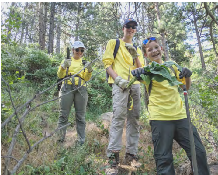
Removing Houndstongue on a vegetation management project

Crew Fun Fact: Listening to Africa by Toto on every truck ride