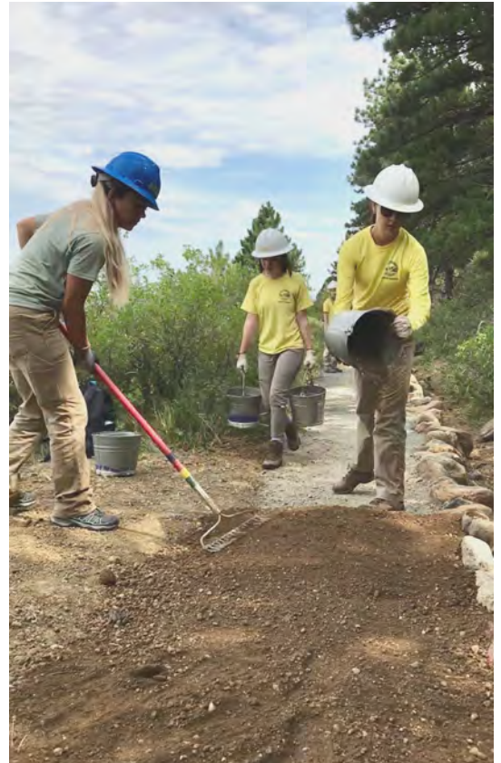
During week four all four crews were assigned to move 8 tons of road base to complete the turnpike on Doudy Draw.