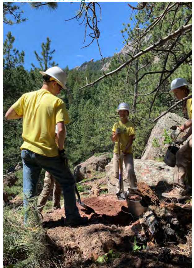
Below: Removing duff piles on Green Mountain West Ridge