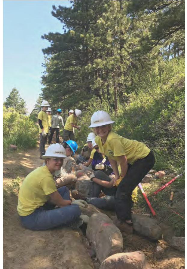
Above: Setting rocks for a turn pike on Doudy Draw