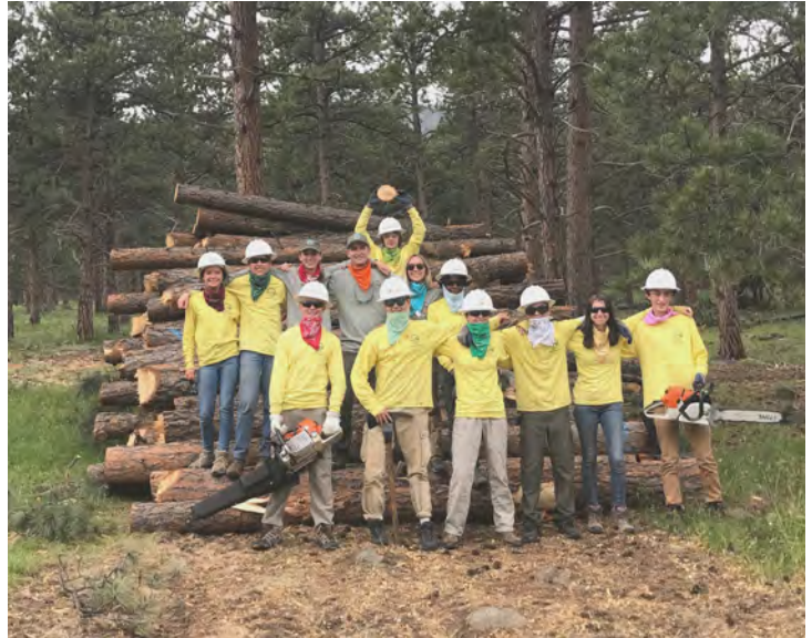
Standing in front of a log pile after chipping and dispersing slash with FEMP.

Greatest Accomplishment: Not getting bit by a rattle snack after Garrett stepped on it.