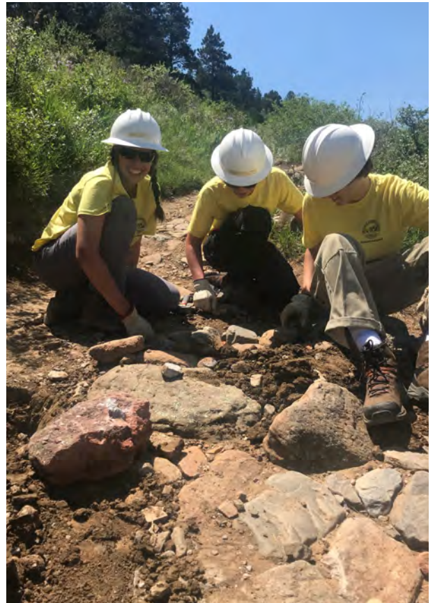
Above: Setting rocks patio style on Doudy Draw.