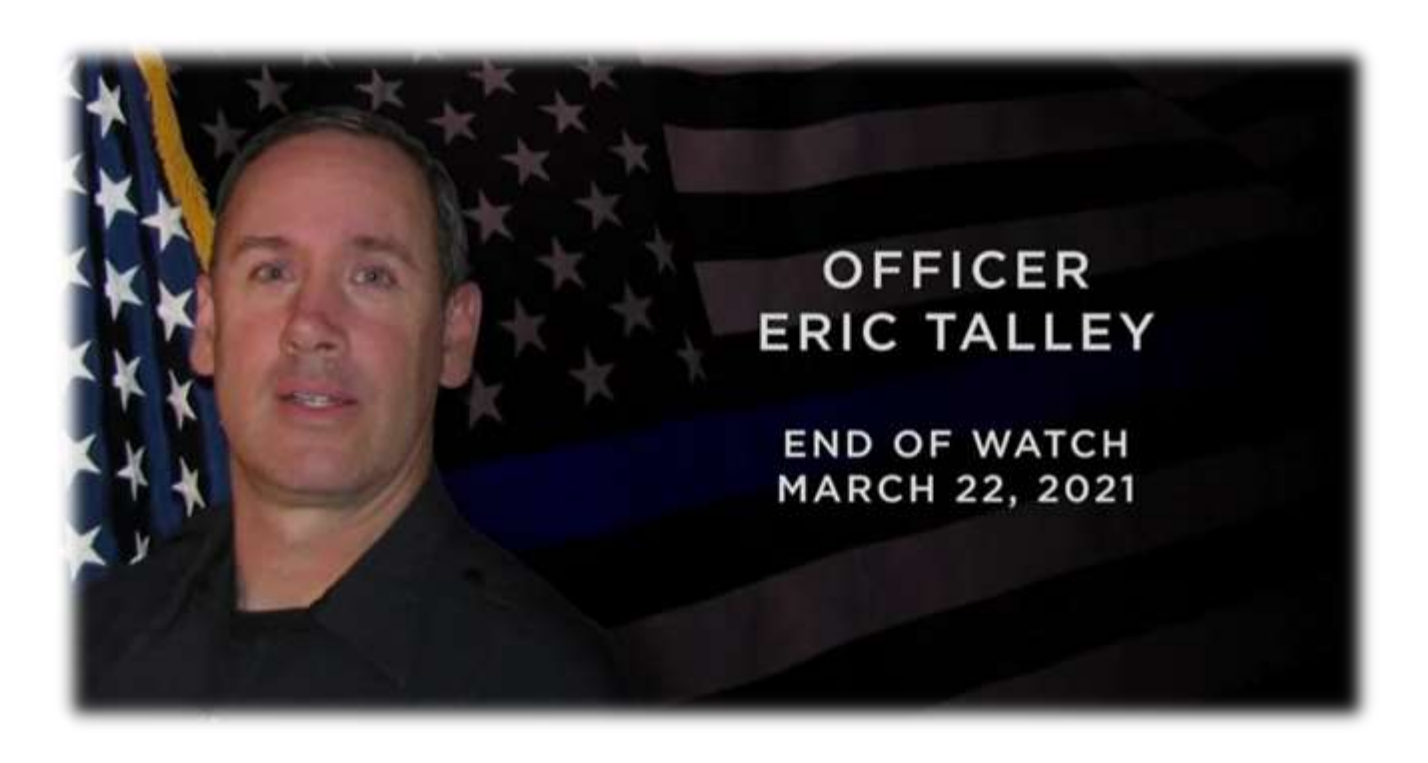
Your sacrifice will never be forgotten.