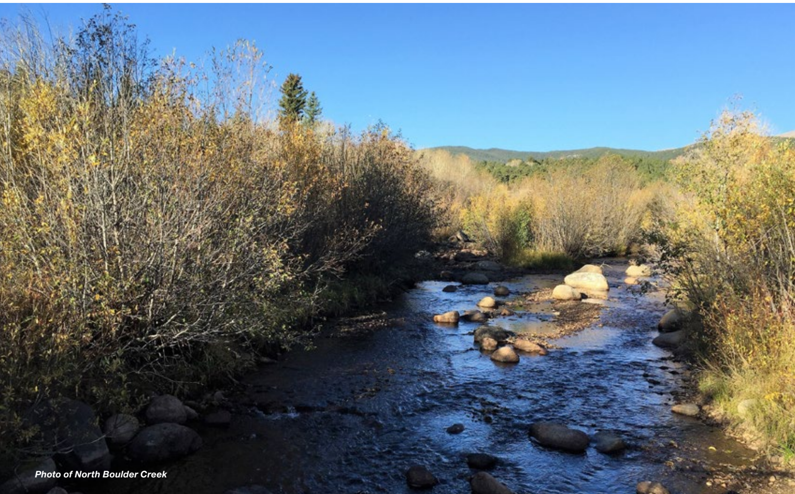
Photo of North Boulder Creek

Please share the above information with all the other people who drink this water, especially those who may not have received this notice directly (for example, people in apartments, nursing homes, schools, and businesses). You can do this by posting this notice in a public place or distributing hard copies.