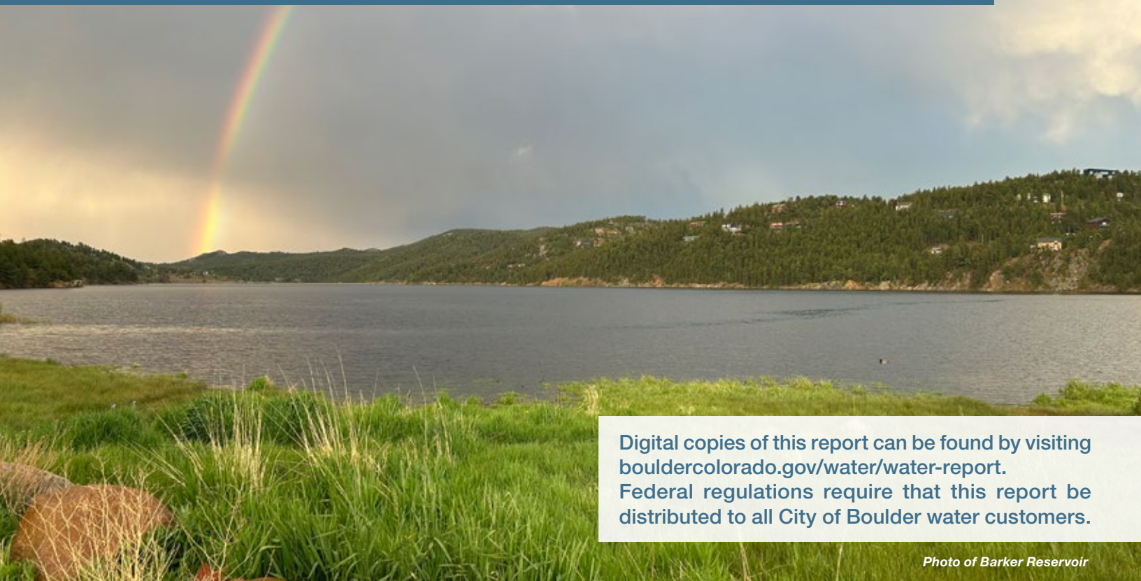
Photo of Barker Reservoir

Digital copies of this report can be found by visiting bouldercolorado.gov/water/water-report . Federal regulations require that this report be distributed to all City of Boulder water customers.