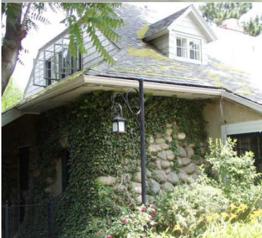
1707 Hillside Rd., 2002.