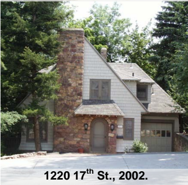
1220 17 th St., 2002.