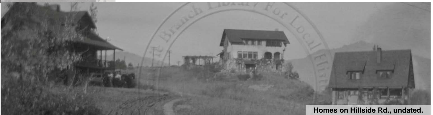
Homes on Hillside Rd., undated.