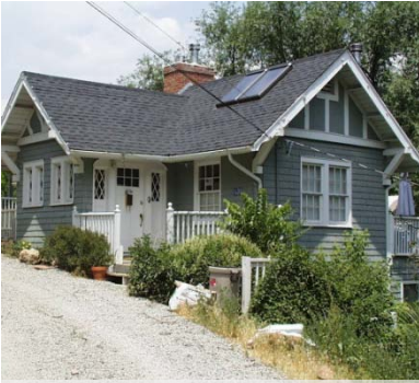
1601 Hillside Rd., 2002.