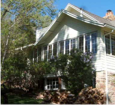
1610 Hillside Rd., 2002.