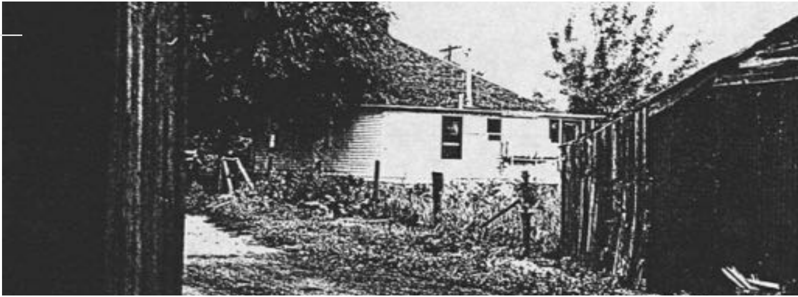
PLATT FARMHOUSE: 1946