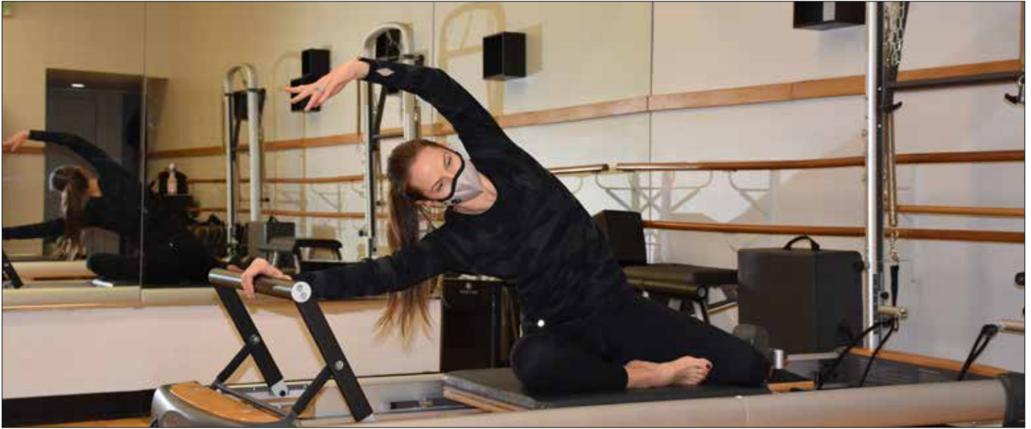
Private and semi-private lessons are a great way to learn the basic concepts or hone your skills in a private environment!