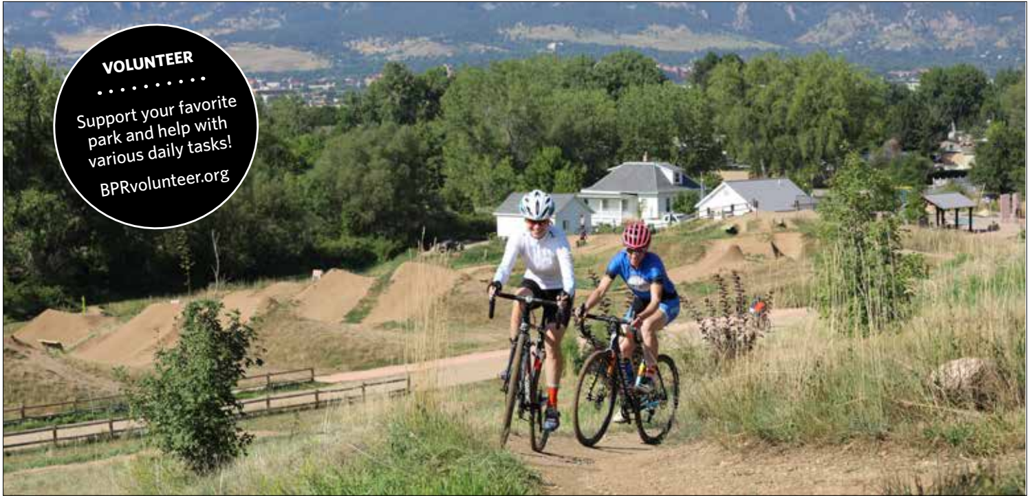
Tackle the trails, jumps and features of Boulder's world-renowned Valmont Bike Park this fall, we have something for all skill levels.