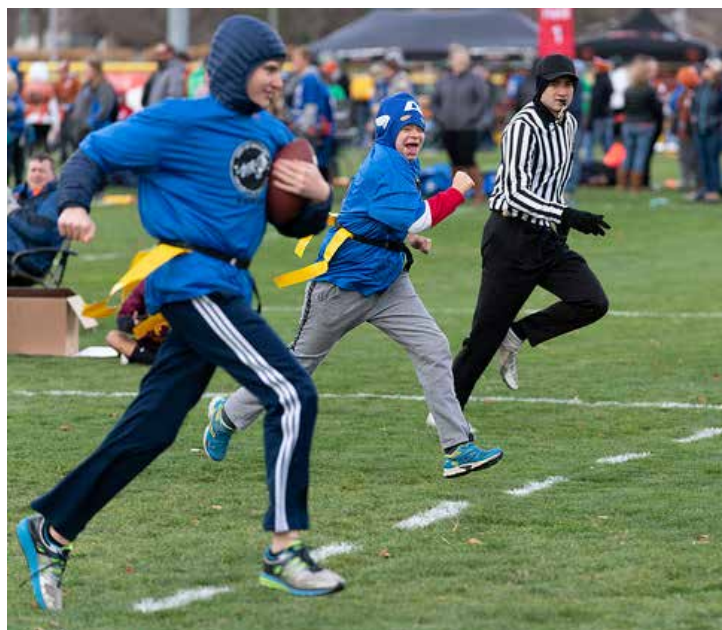
It's football season! Come have some fun with flag football!